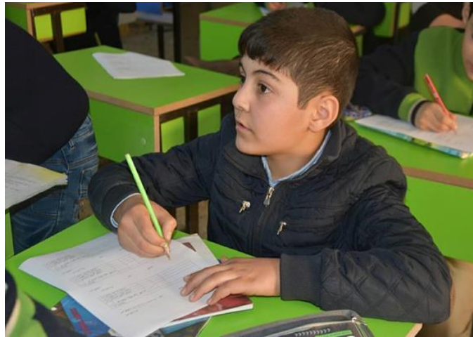
Fig.2. Data collection from of the palm primary school.

Because of a much higher cumulative exposure than today's adults when they were at the same age, children might be more vulnerable to any effects of RF and microwave radiation. As long as adverse effects on health cannot be ruled out with some degree of certainty, it appears to be appropriate to instruct children and their parents about a prudent use of mobile phones. Moreover, in the absence of new scientific evidence, WHO is focusing attention on the potential effects of exposure to electromagnetic fields on children [16]. Finally, many reports agree that the distraction caused by mobile phone use while driving represents a serious threat to health.